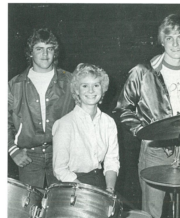
This year's all-school production of "Pippin" was greeted with the usual enthusiasm that has made the productions an annual event. "Pippin" is the story of the first-born son of the Emperor Charlemagne, Pippin. An extraordinary and talented young man, Pippin is nevertheless obsessed with the need to be completely fulfilled.